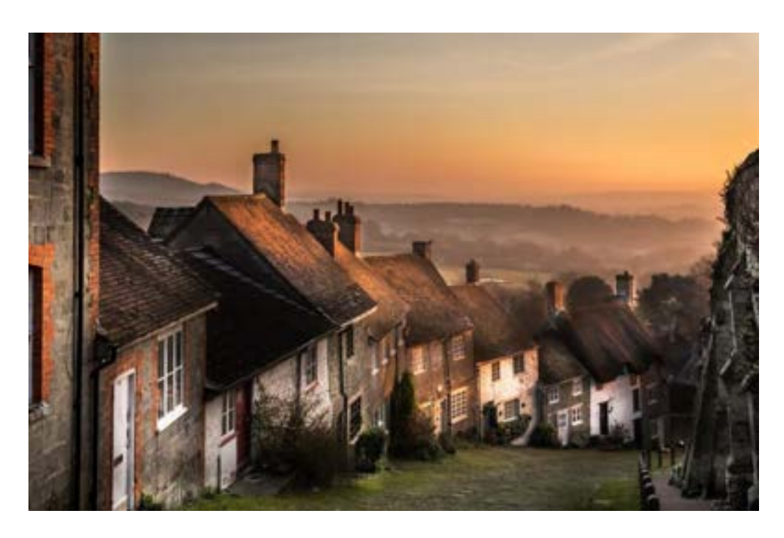
Gold Hill is a steep cobbled street and it is famous for its beautiful view.

Shaftesbury is a small market town in Dorset. In this town you can find the famous Gold Hill which some of you may have heard of. This place has been described as "one of the most romantic sights in England."