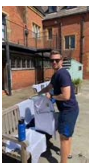
Mostly E's: You're...