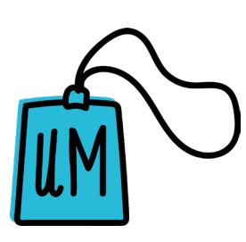
Check if you can fly "UM" (without an adult) to reduce your emissions.